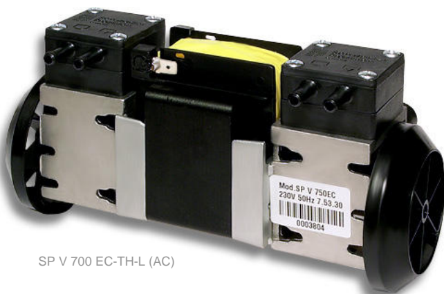
SP V 700 EC-TH-L (AC)