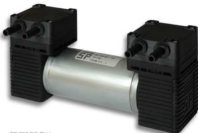
SP 725 EC-TH-L