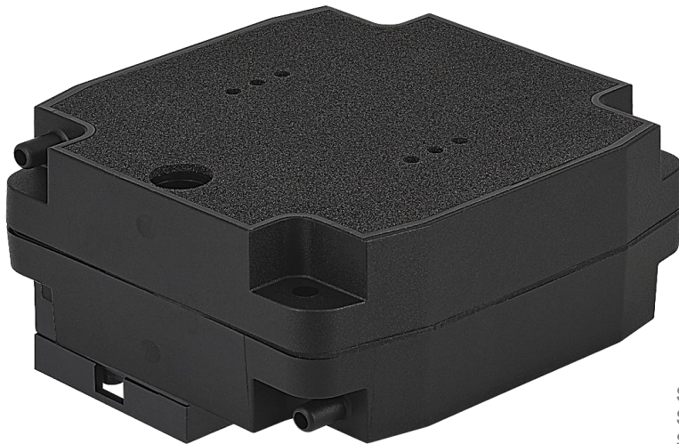
SP 3300 LI-D / LI-DV SP 3500 LI-D / LI-DV SP 3800 LI-D / LI-DV

The pumps listed on this data sheet represent a cross-section of the large number of possibilities for each pump type. Based on our modular pump design, all pumps can be customised exactly to meet the needs of your application - within days and at standard pricing. Please contact us for details.